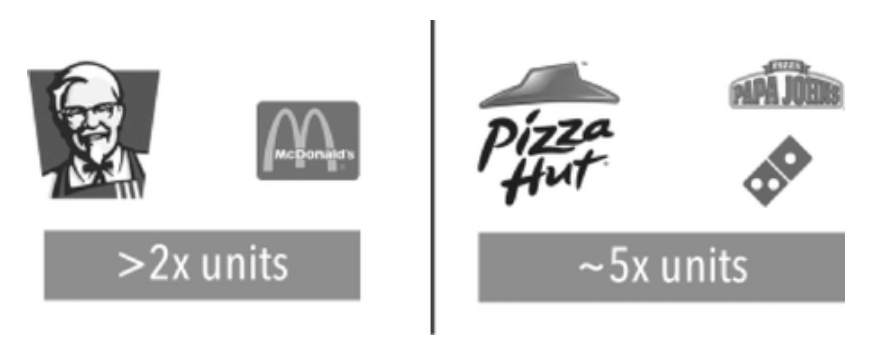
Strong Presence in 1,100+ Cities, 2 Billion+ Consumer Visits a Year

<u>High-quality, great-tasting food, including local favorites with compelling value and a Western experience</u>. Our KFC and Pizza Hut Casual Dining brands offer consumers a Western menu and experience, while also providing menu items that appeal to local taste preferences. Moreover, we provide our guests a clean and attractive dining destination. Our menus focus on providing our customers great food at a great value.