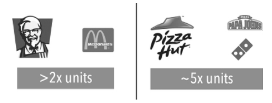
Strong Presence in 1,100+ Cities, 2 Billion+ Consumer Visits a Year

<u>High-quality, great-tasting food, including local favorites with compelling value and a Western experience</u>. Our KFC and Pizza Hut Casual Dining brands offer consumers a Western menu and experience, while also providing menu items that appeal to local taste preferences. Moreover, we provide our guests a clean and attractive dining destination. Our menus focus on providing our customers great food at a great value.